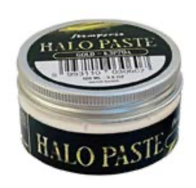
<u>K3P70A</u> Gold - ML80

WATER-BASED FINISH WITH A GLAZING EFFECT, VERY FLUID, SELF-LEVELING. SUITABLE ALSO FOR LARGE SURFACES.